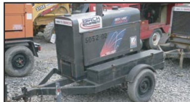
REDIARC 300 Amp Welder Starting at $3,000

To see more of our specials go to : www.birchequipment.com