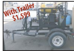
With Trailer $1,599 Hot Water Pressure Washers Starting at: $1,199