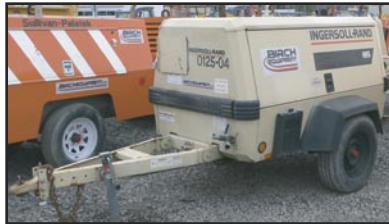
185 CFM Air Compressors Starting at $6,399