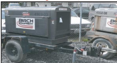
Lincoln 400 Amp Welder Starting at: $1,999