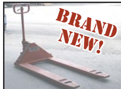
BRAND NEW! Manual Forklift Pallet $329