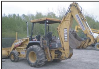
John Deere 310 Backhoe Starting at $28,450