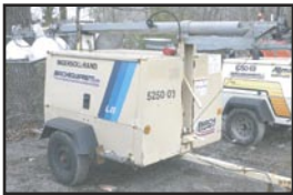
Ingersoll Rand Light Tower Starting at: $3,850