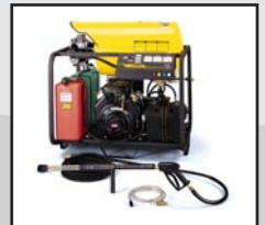
3000 PSI Hot Water • trailer mounted