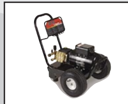
1000 PSI Electric • easy to use & transport.