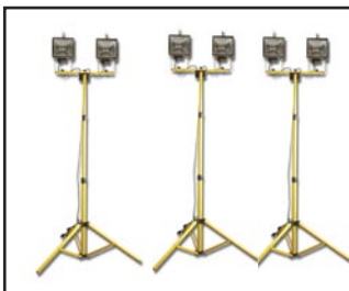
Tripod Light Stands • Starting @ $29

For more equipment info go to www.birchequipment.com