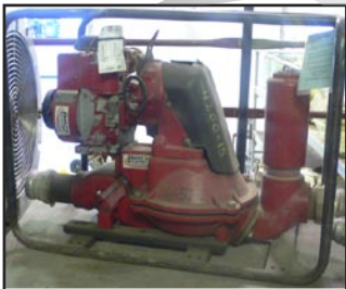
3" Diaphragm Pumps • Starting @ $495

prices good through 03/31/2009 or while supplies last