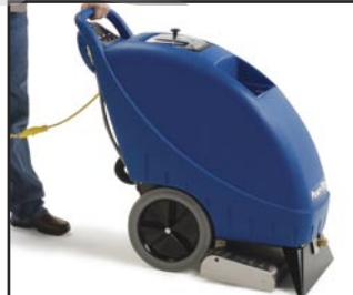
Carpet Extractors • Starting @ $395