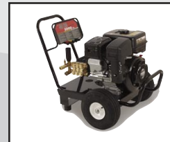
2000-4000 PSI Gas • great for home & light industrial