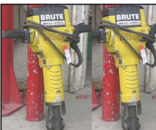
60# Electric Breakers • Starting @ $699