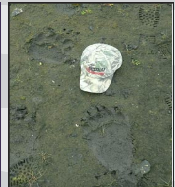
Photo from day hike with our Sitka customer, Hugh Bevan. Hugh's hat in the photo; Hugh in nearby tree.